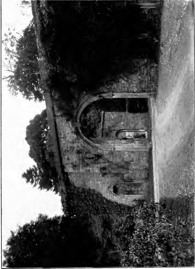
THE OLD GATEWAY AT GOSFORD CASTLE